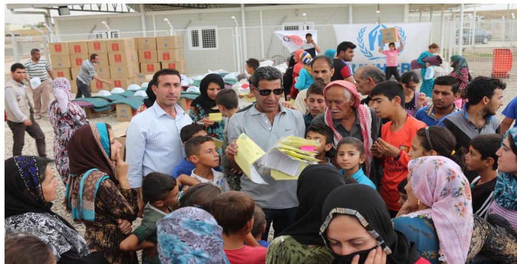
Distribution of summer items in Domiz Camp, Duhok.

Refugees living in non-camp settings are finding difficulties in paying rent or have settled in apartments/houses that are very inadequate.