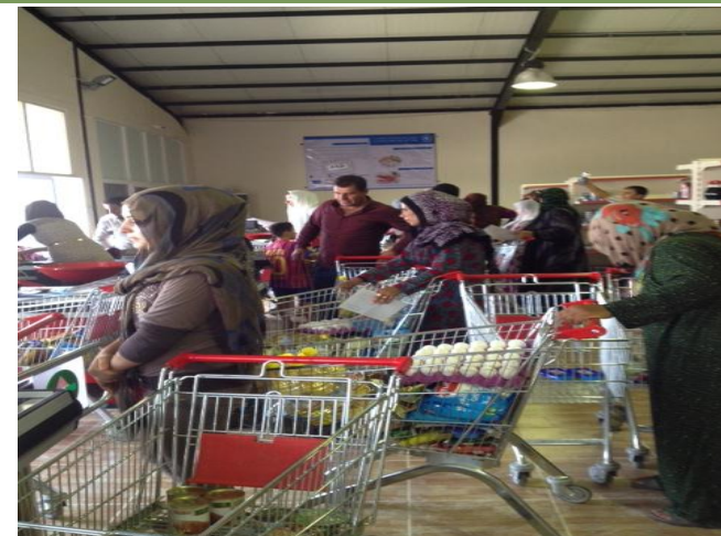
Voucher redemption, Darashakran camp, Erbil.

This approach reduces the caseload to 50 percent (45,204 of individuals in August) compared to 102,899 individuals in July 2015).