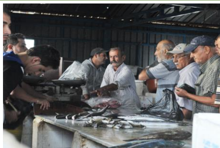
Renovation of a fish market in Sarafand, Lebanon

CARE International published a new report on social stability in Lebanon, focused on the Chouf and the T5 region. The report's findings are in line with previous assessment, highlighting that negative perceptions, differences in values and prejudices exacerbate tensions related to pressure on basic services (particularly water, electricity, sanitation and solid waste) and competition for economic opportunities. The study also confirms the lack of interaction between communities. The recommendations of the study are also well in line with the overall LCRP, calling for support to local institutions, livelihoods opportunities, and increased accountability from response partners.