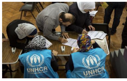
Verification Exercise- Cairo.