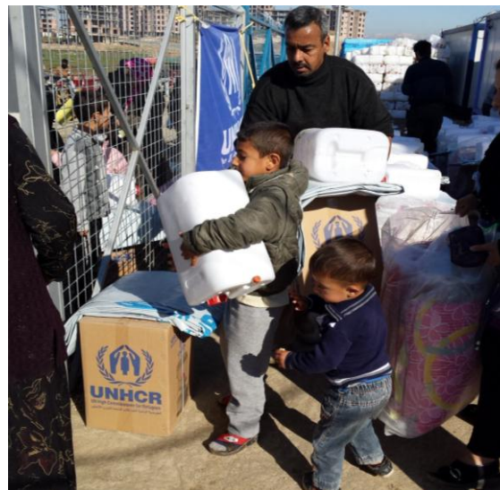
Domiz Refugee Camp, Duhok.

As part of UNHCR support to the Syrian refugees in Al-Obaidi and through Camp management partner (ISHO), UNHCR has distributed 6480 pieces of baby diapers, 4500 pieces of sanitary napkins and 2520 pieces of adult diapers. These items are the part of available items in Al-Obaidi warehouse; due to security situation it is not possible for UNHCR to deliver any supplies. 11,250 liters of Kerosene to all Camp population have been provided as well, mainly for cooking needs.