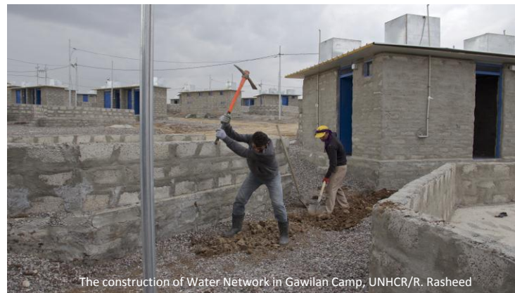
The construction of Water Network in Gawilan Camp

In Al-Obaidi camp: camp, even with the challenges to access Al-Obaidi camp AFKAR Society, in