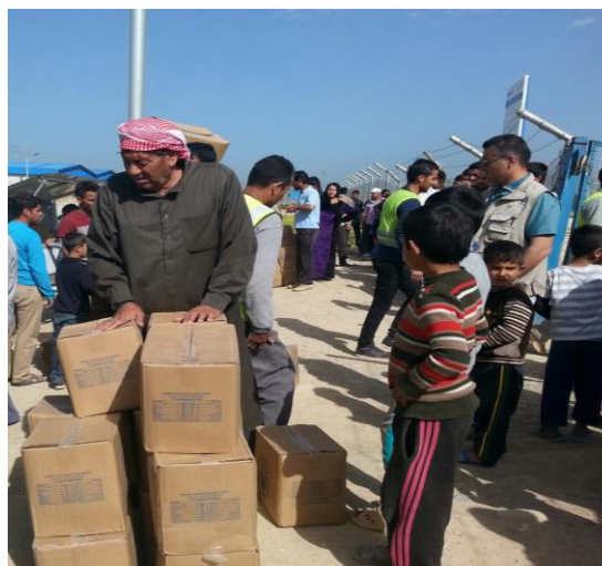
Food distribution in Arbat camp, Sulaymaniyah, WFP/Neiaz Ibrahim

Bulgur: 3 kg; Pasta: 4 kg; Lentils: 1.8 kg; Rice: 4 kg; Vegetable Oil: 0.91 kg; Sugar: 1.5 kg; Salt: 0.25 kg and Tomato Paste: 0.80 kg.