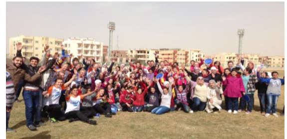
The participants of the sports day, Photo©CARE International (EGYPT)