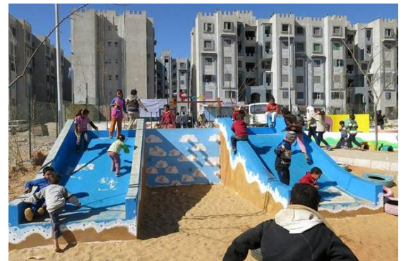
Meet and Play area at Masaken Othman