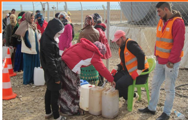
Qushtapa Refugee Camp, Erbil.