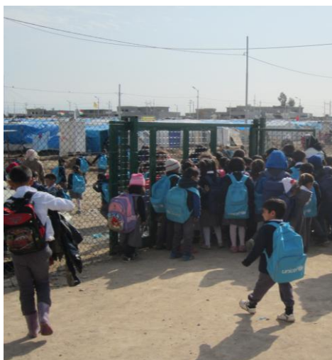
School in Qushtapa Refugee Camp, KR-Iraq - Erbil

Catch-Up Classes for 1,997 (1,112 boys and 885 girls ) students from the new Kobane caseload are ongoing in 4 camps in Erbil; Kawergosk (227), Darashakran (1,394), Qushtapa (112) and Basirma (264) camps. These classes are allowing students who missed school due to displacement to re-engage in the formal education system.