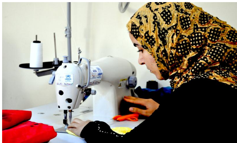
Vocational training course in Harran camp, Şanlıurfa, Turkey

UNDP is currently working on a project aiming to support the occupational skills and access to labour market for Syrians under temporary protection, with the EU in Gaziantep, in industrial and service sectors.