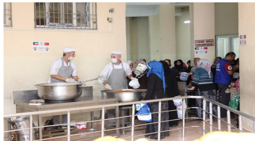
Food kitchen supported by IOM in Gaziantep.

During January and February 2015, IOM supported the food kitchen run by the municipality in Gaziantep. The food kitchen provides one meal per day for 737 Syrian households (around 4,000 persons) living in urban areas in Gaziantep.