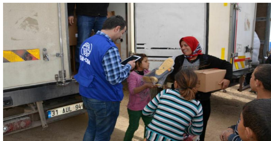
NFIs provided for Syrian refugees in Adana

The partners are distributing vouchers based on their own needs assessments, but harmonization of vulnerability criteria as well as cash assistance amounts and modalities are underway through the UNHCR & WFP chaired 'Food, Non-food item, Cash and Voucher' Working Group. In parallel, UNHCR is in the process of negotiating the possibilities of using the e-card services, similar to a debit card, for provision of cash assistance for Syrian refugees with the Turkish Post Office (PTT). Provided that the modality can be finalized, UNHCR would be able to expand the cash assistance in 2015, in a wider area of coverage and to the most vulnerable refugees and who will not be able to join the labor market.