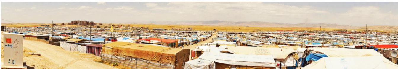
Domiz Refugee Camp, Duhok.