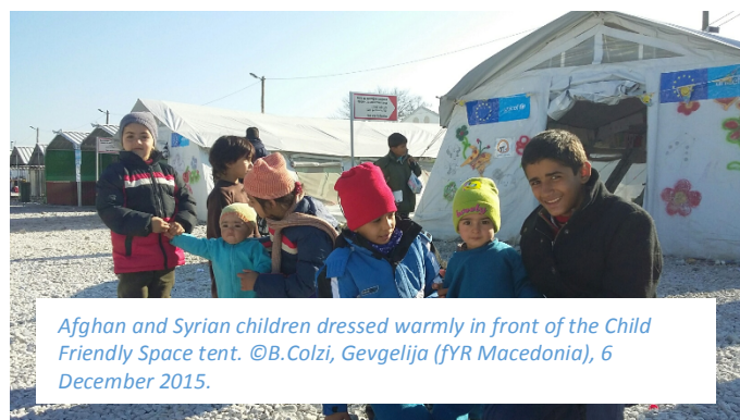
Afghan and Syrian children dressed warmly in front of the Child Friendly Space tent. Gevgelija (FYR Macedonia), 6 December 2015.