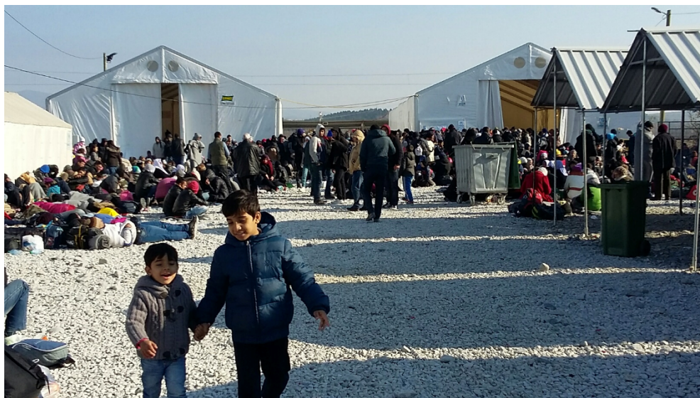
Refugees waiting for the train in Vojvodina after long delays. ©UNHCR/B.Colzi, Vojvodina (FYR Macedonia), 9 December 2015.