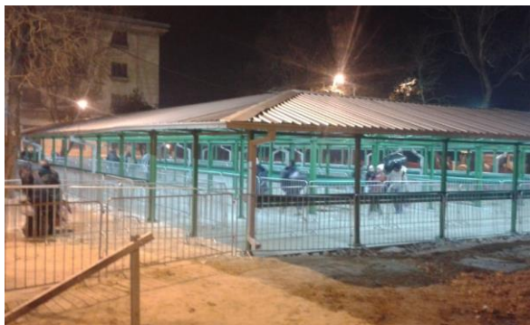
The covered pre-registration waiting area at Preševo RC, Preševo (Serbia), ©UNHCR, 27 December 2015

UNHCR/DRC distributed UNHCR blankets, water, winter jackets, winter boots and socks. The health clinic provided medical assistance at the RAP. UNICEF/DRC/CSW hosted children and mothers in their Child Friendly Space container.