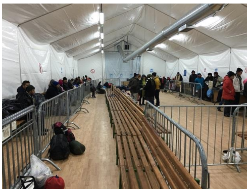
Awaiting registration in Preševo (Serbia), ©UNHCR, 24 January 2016

Police, Gendarmerie, IOM, Philanthropy, Remar, Medical Center, UNHCR, MSF, DRC, World Vision, were active at the RAP. UNHCR/DRC/SPDE distributed 550 winter boots, 164 winter jackets, UNHCR blankets, 152 bottled water, while UNICEF and Philanthropy/CRS distributed other non-food items. UNICEF/DRC hosted 10 children and 4 women in their child friendly space.