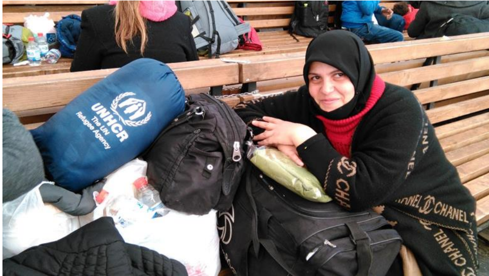
A refugee received a new UNHCR sleeping bag in Vojug reception centre, former Yugoslav Republic of Macedonia ©UNHCR/I. Ciobanu, January 2016.

As of 10 February 2016, 497 persons relocated so far to 12 Member States (279 individuals were relocated out of Italy and 218 out of Greece). In terms of places pledged, 17 Member States and Lichtenstein have offered relocation places.