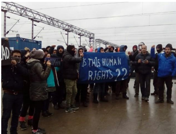
Protestors at the train station, Šid (Serbia), 18 February 2016

With the railways blocked by demonstrators, approximately 400 refugees were transported to Croatia on buses, instead of by train.