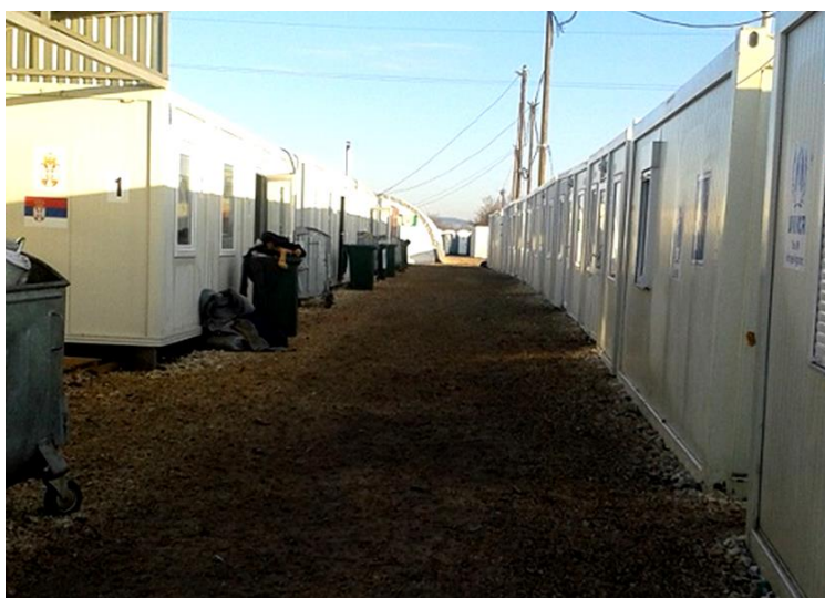
Miratovac – Cleanliness of this refugee ai/transit point was greatly improved