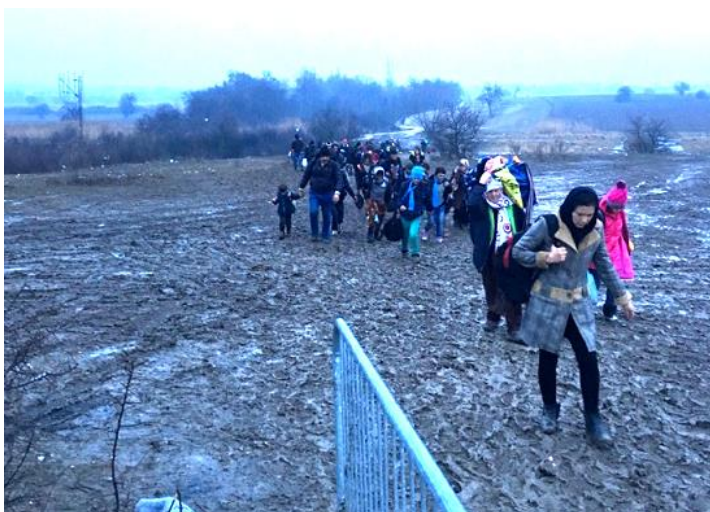
Miratovac – Refugees still walk 2.5 km on the dirt road (green border) from the FYR Macedonia to Serbia