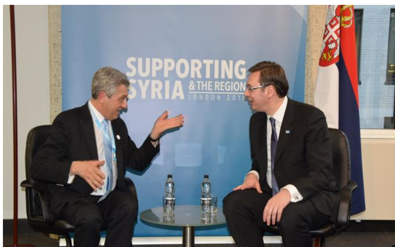
Serbia's Prime Minister Aleksandar Vučić and UN High Commissioner for Refugees Filippo Grandi at „Support Syria and the Region” Conference in London

The UK, Germany, Kuwait, Norway, and the United Nations co-hosted the conference in London on 4 February 2016 to raise significant new funding to meet the immediate and longer-term needs of those affected by the war in Syria. The conference raised over US$ 11 billion in pledges – $5.8 billion for 2016 and a further $5.4 billion for 2017-20 to enable partners to plan ahead. Serbia pledged 500,000 EUR for assistance to the children of Syria through UNICEF. On this occasion, Serbia's Prime Minister Aleksandar Vučić met with UN High Commissioner for Refugees Filippo Grandi, and they agreed on the necessity for a common European solution to the refugee crisis.