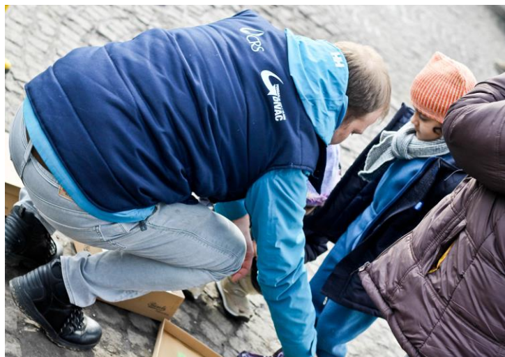
Adaševci – CRS/Divac team providing a refugee girl with warmer footwear, Photo@Divac Foundation