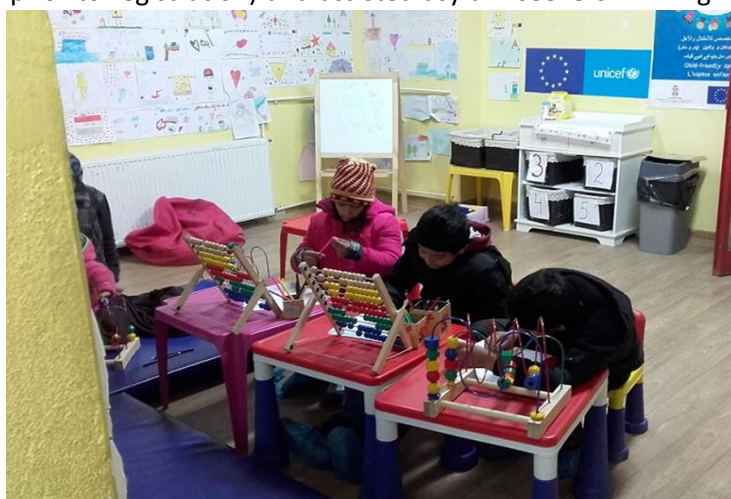
Šid - UNICEF/Word Vision child friendly space was open 24/7