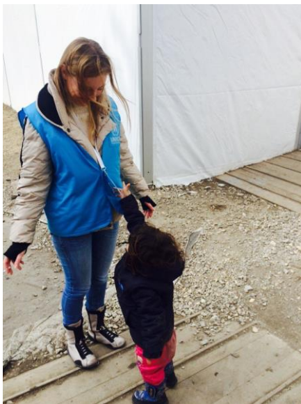
Refugee child playing outside the rub hall, Šid (Serbia), 25 February 2016

1,102 refugees departed to Croatia on two trains. In 277 instances, refugees from Syria and Iraq, including women and children, were not allowed to board the two trains by Croatian authorities. Reported reasons for being screened-out included family members already present in the EU, stay of more than one month in transit countries (including Turkey), lack of any of the four now retroactively required documents, slight spelling variations/mistakes in these four documents, last place of residence in Syria not cities of Homs, Aleppo or Raqqa.