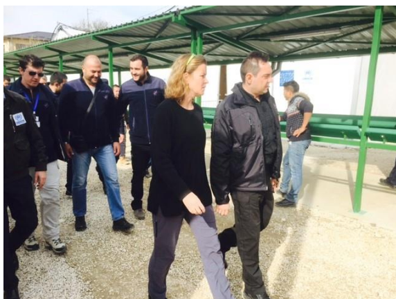
The Deputy High Commissioner Kelly Clements touring the Reception Centre in Preševo together with the Minister of Labour Aleksandar Vulin, Preševo (Serbia), 8 March 2016

No one arrived during the reporting period at the Miratovac Refugee Aid Point (RAP) from FYR Macedonia.