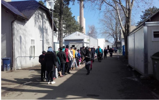
Food distribution in the Šid RAP, Šid (Serbia), ©UNHCR, 14 March 2016

Uncertain about their future and dissatisfied with accommodation and services unsuitable for longer-term stay, anxiety levels among the refugees stranded in the West continued to grow.