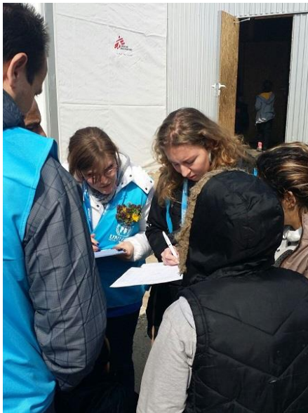
UNHCR team filling the verification list in the Šid RAP, Šid (Serbia), 21 March 2016

538 refugees from Syria, Afghanistan and Iraq, were hosted at the temporary Refugee Aid Point (RAP) in Sid - far exceeding its maximum capacity of 380. Hygiene and sanitation remained very challenging with only three showers available. The risk of contagious diseases or parasites is rising. UNHCR/SCRM continued verification of population.