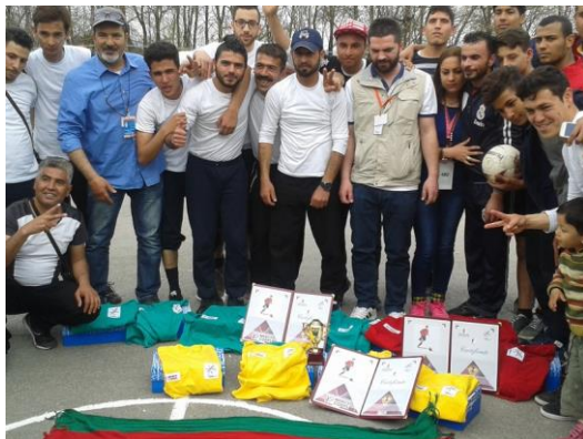
The winning team at the football tournament, Preševo (Serbia), ©UNHCR, 2 April 2016

During the reporting period the number of refugees sheltered in the three Refugee Aid Points (RAP) in the West decreased to 360 , with about 60 hosted in Sid, 129 in Adasevci and 176 in Principovac RAPs. Several departures were observed daily, mainly towards the Hungarian border.