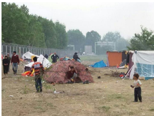
Improvised shelters at the Horgoš I border crossing, Horgoš (Serbia), 17 April 2016

Around 250 asylum seekers, including many women and children, waited outside the two "transit zones" near Kelebije and Horgos I border-crossings at any one time. They stayed in the open land without shelter or toilets. Garbage collection and disposal continued to be a challenge too. Some 30 asylum seekers were admitted daily into each "transit zone".