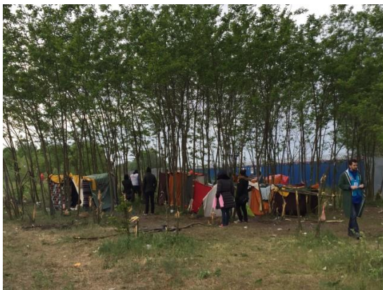
Improvised shelters increase at the Horgoš I border crossing, Horgoš (Serbia), ©UNHCR, 19 April 2016

UNHCR and partners assisted over 350 refugees, asylum seekers and migrants. Most were from Afghanistan, Pakistan or Somalia. The Asylum Info Centre remained open 24/7 and assisted new irregular arrivals from FYR Macedonia and Bulgaria to access asylum procedures in Serbia. UNHCR/DRC and MSF provided medical assistance while Refugee Aid Miksaliste also helped them. Some 250 refugees/migrants spent the nights in parks near the bus and train stations.