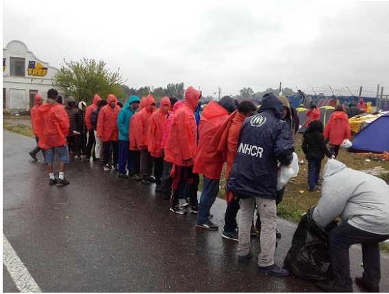
Distribution of food at the Kelebija border crossing on the Serbian-Hungarian border, Kelebija (Serbia), ©UNHCR, 25 April 2016

While HCIT access to asylum seekers at the two border crossing with Hungary was still denied by the authorities, the organisation distributed food, 15 water bottles, 30 WFP HEBs and five raincoats in different locations near Subotica and at the bus station.