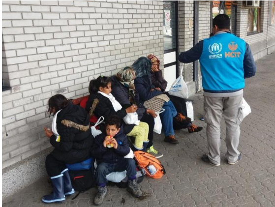
Food distribution to refugees/migrants at the bus station, Subotica (Serbia), 3 May 2016

In rainy weather some 260 asylum seekers, including many women and children, waited to be admitted into the two “transit zones” near Kelebija and Horgos I border crossings every day. Sanitary conditions remain of grave concern. Requests to place chemical toilets and re-admit HCIT are pending approval from authorities.