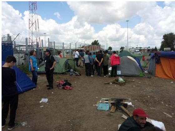
Improvised shelter in front of the “transit zone”, Kelebija (Serbia), @HCIT, 4 June 2016

Between 390 and 460 asylum seekers, mainly women and children, camped outside the “transit zones” at Kelebija and Horgos I border crossings for days in the open. Serbian authorities installed three chemical toilets at each border zone, but did not yet organize their daily cleaning.