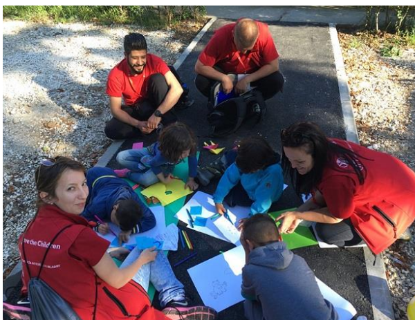
Recreational activities at the Reception Centre in Preševo, Preševo (Serbia), @UNHCR, 8 June 2016

The Reception Centre (RC) in Presevo accommodated between 54 and 104 refugees. In addition, during the reporting period, 99 new arrivals, were accommodated there before departing to assigned asylum centres.