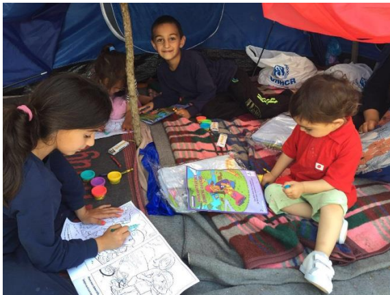
World Refugee Day outside Horgos I “transit zone”, Horgos (Serbia) @UNHCR, 20 June 2016

Over 670 asylum seekers were present in the North on a daily basis. Around 340 stayed for days or weeks in improvised tents outside the “transit zones” at Kelebija and Horgos I border crossings. Even if there are still gaps to address, the sanitary conditions in both sites improved after a regular cleaning of toilets and garbage collection.