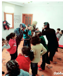
IOM - Recreational activities at IBC Istanbul

In May 2016, IOM assisted 84 cases, assisting 332 individuals. Material assistance within the scope of ECM (Emergency Case Management) is provided to the most vulnerable cases to enable individuals have access to their rights and find long term solutions to their urgent needs. IOM continues supporting two community centers, IBC in Istanbul and SSG in Antakya and one primary health clinic in Istanbul which is run by Doctors Worldwide Turkey (DWWT). IOM's case management team also participated in the Protection Working Group in Izmir to introduce the Emergency Case Management Programme, as part of IOM's plans to expand the programme to Izmir.