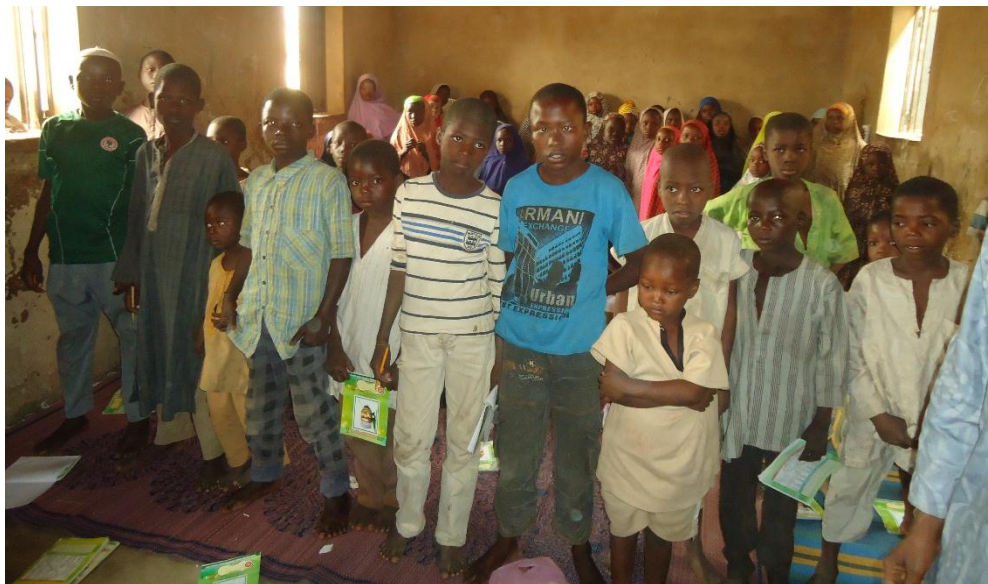
(Photo: Pupils at a makeshift primary school for IDPs in the Bauchi metropolis 16 March 2015 Tamfu ©UHNCR)