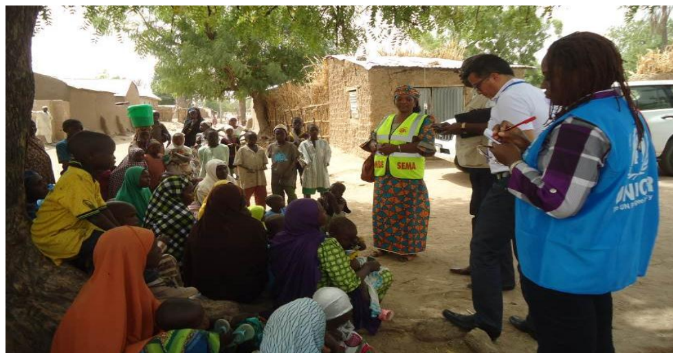
(Photo: UNHCR community service staff engage with community IDPs on the outskirts of Gombe metropolis in Gombe State 17 March 2015)