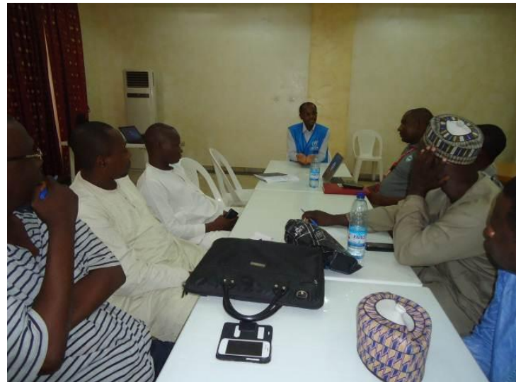
Photo: UNHCR protection Officer goes down to the nitty-gritty of vulnerability and targeting criteria with Nigeria Red Cross staff. Tamfu ©UNHCR, Yola 20/03/2015