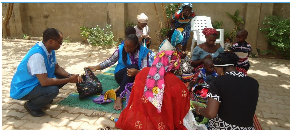
(Photo: UNHCR Protection staff discuss possibilities of supporting community IDPs in involved in recycling polythene material into lady handbags in Yola; 21 March 2015)