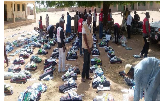
UNHCR and the NRCS arranging NFIs for distribution at Gombe, Tshilombo