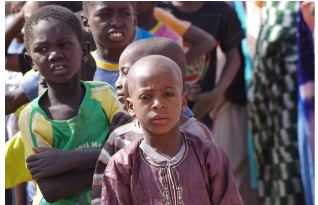
UNHCR supports the six primary schools in Mberra camp.