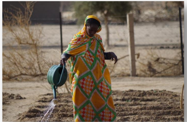
UNHCR supports gardening activities in Mberra camp. UNHCR/S. Laroze Barrit/January 2015