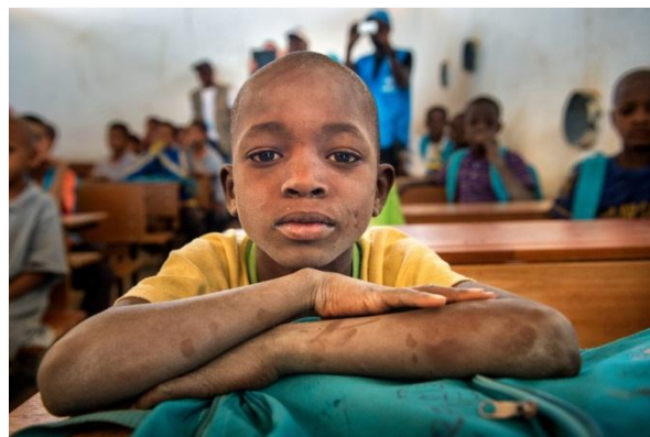
Child at school in Mberra camp UNHCR/A.Dragaj/March 2015