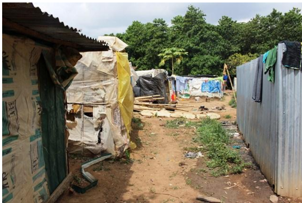
IDPs in FCT, Abuja still live in very deplorable hygiene and other situations. PIC: GOREN@UNHCR