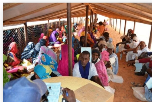
General food distribution in Mberra Camp.