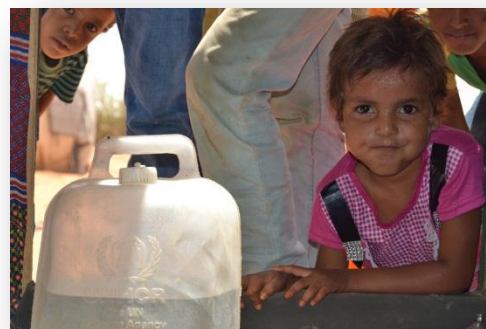
Jerry can distributed by UNHCR in Mberra Camp