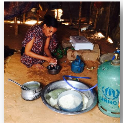
Gas cylinder in a household in Mberra camp