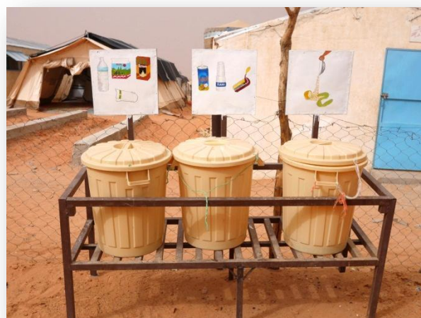
Waste management in Mberra Camp.