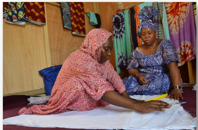
Refugee Women in Nouakchott who benefited from UNHCR's support programme for income-generation activities