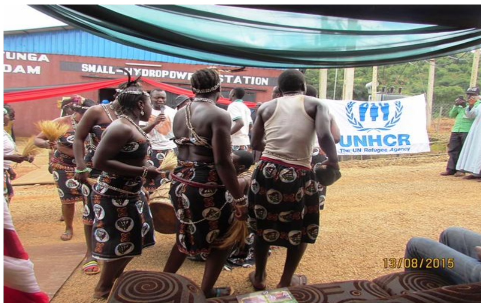
Cultural animation during the official inauguration of the UNHCR-funded Tunga Dam Small Hydro Power project in Kakara, PHOTO: GARRIBA@UNHCR 13 August, 2015