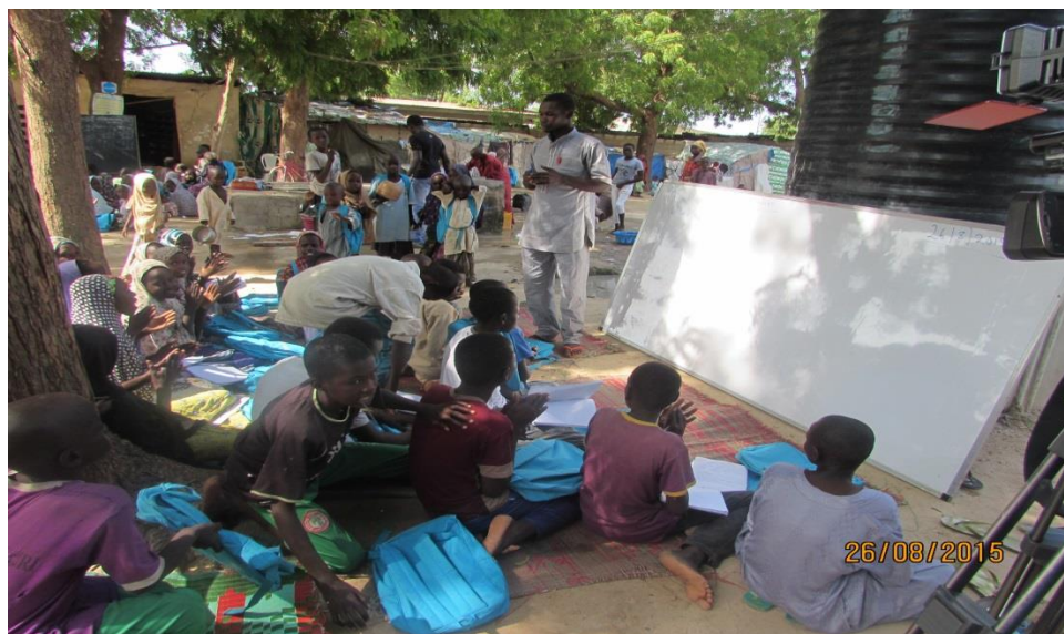
IDP pupils in Maiduguri studying under unfavorable conditions 26 August, 2015.