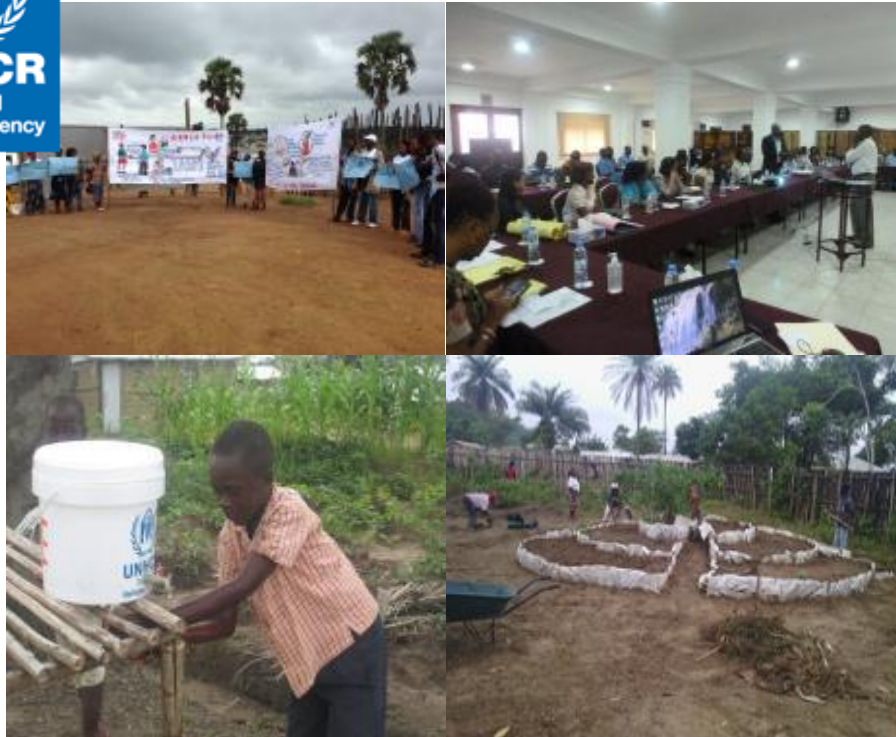
A young refugee boy washing his hands in the Little Wlebo Camp; Code of Conduct Refresher Training Workshop in Monrovia; Ebola awareness continuing in Little Wlebo Camp. Vegetable land preparation in Bahn Camp