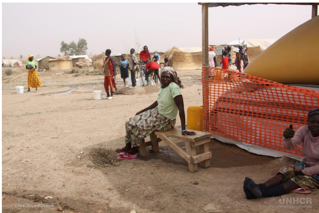
Cameroon/Nigerian refugee woman rests beside water bladder in Minawao camp