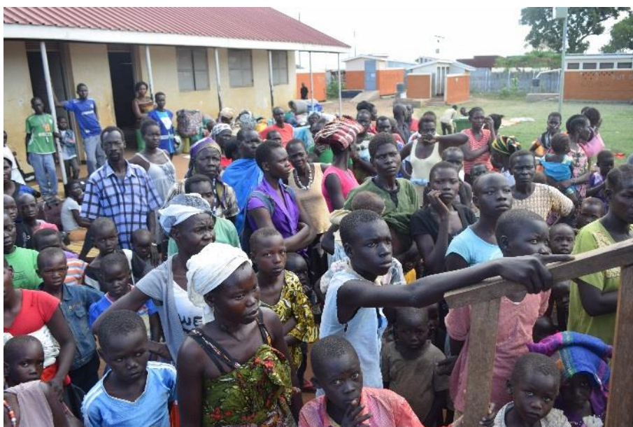
Elegu collection point, where the majority of new arrivals (more than 90%) are women and children.