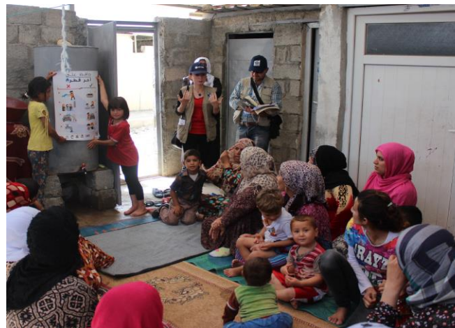
Sessions for the water conservation campaign in Erbil governorate