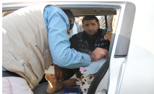
Cash Distribution for Syrian Refugees. Erbil City Centre 10 December 2015.

On behalf of UNHCR, YAO provided a wheelchair to a refugee newly arrived from Syria who is living in Arbat Camp.