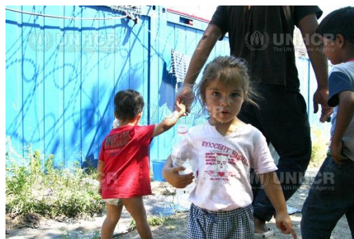
A young girl on her way to collect water at Röszke makeshift refugee camp, near the Hungary-Serbia border.