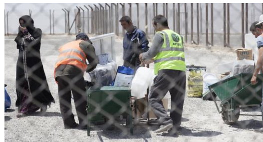
Newly arrived Syrian refugees provided with food, water and tent for shelter, Upon arrival to Azraq camp-Jordan.

Across the region, this assistance was critical in helping Syrians face the many difficulties created by harsh weather conditions, including freezing temperatures, snow storms, torrential rain and flooding. Planning is underway for the 2016/2017 winterization activities, and predictable funding is required to ensure that the winter response can be implemented as efficiently as possible.