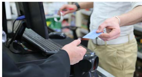
A Syrian woman paying for her food with WFP's e-card, North Lebanon.

Assessments by sector actors in Lebanon will also allow for better understanding of the impact of the crisis on the agricultural labour market.